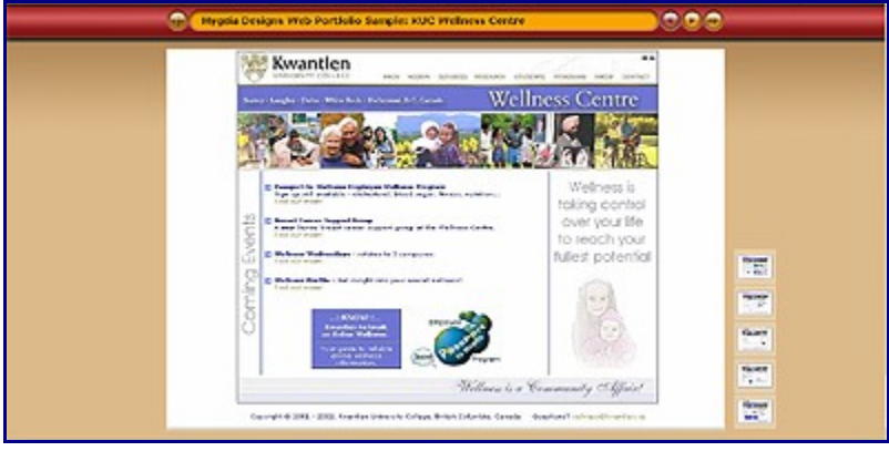
Click to see An Example of a Published Gallery