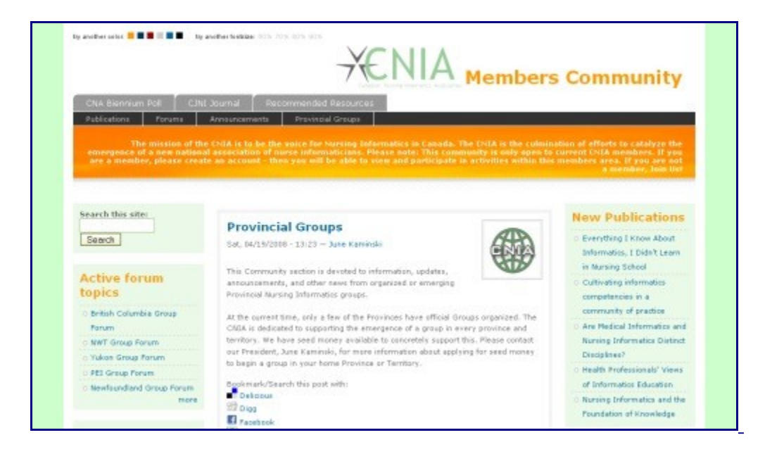
Click to see Theme in Action

Or, you can customize a theme and even create your own from scratch (there are several modules available from the Drupal site that will help you design your theme as well). An example, is the screenshot of a community I built for an educational site, viewable below.